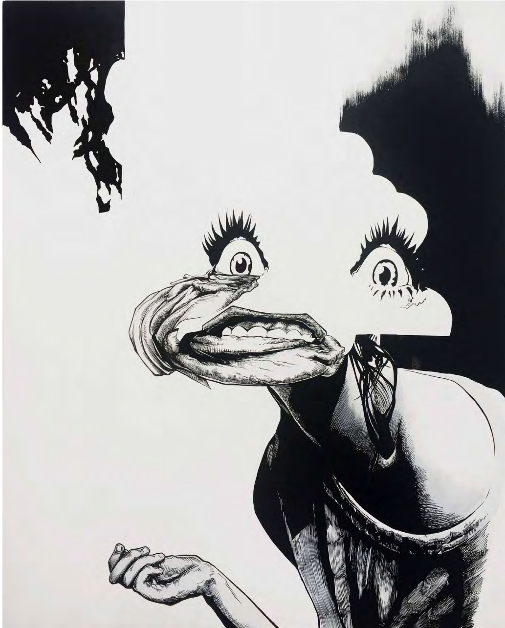
Pizza party discotheque By Brendan Rowe Fineliner and posca on board 40x50cm $450 SOLD