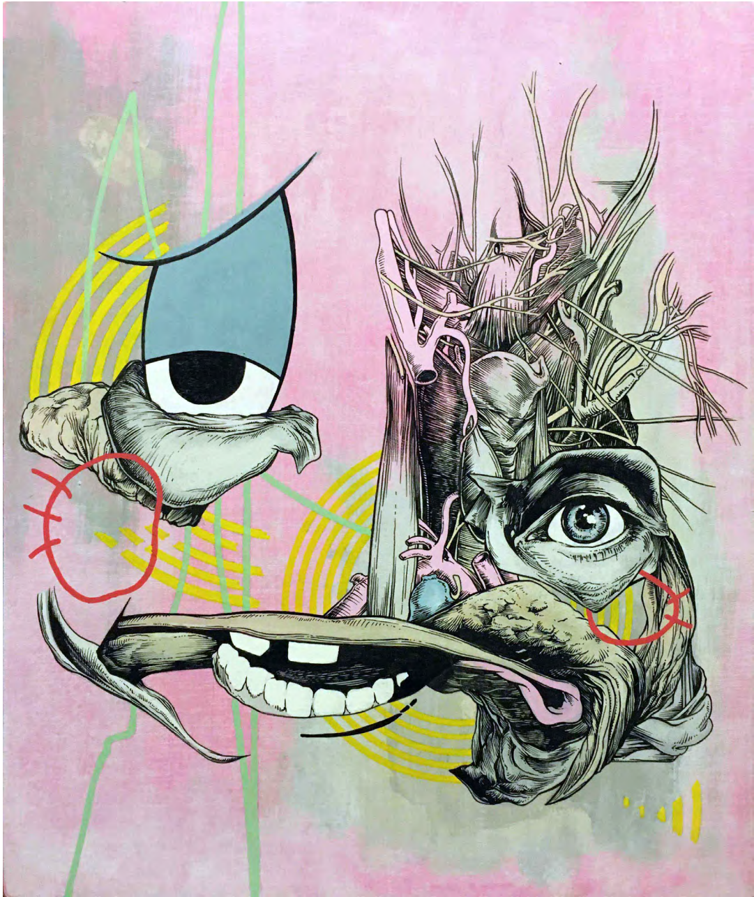
Anatomy anato-you By Brendan Rowe Fineliner and posca on board 25x30cm $350 SOLD