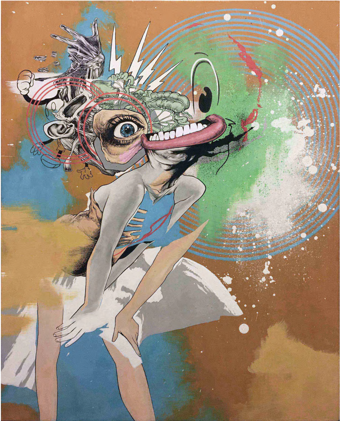
Saturday morning cartoon time By Brendan Rowe Fineliner and posca on board 40x50cm $475 SOLD