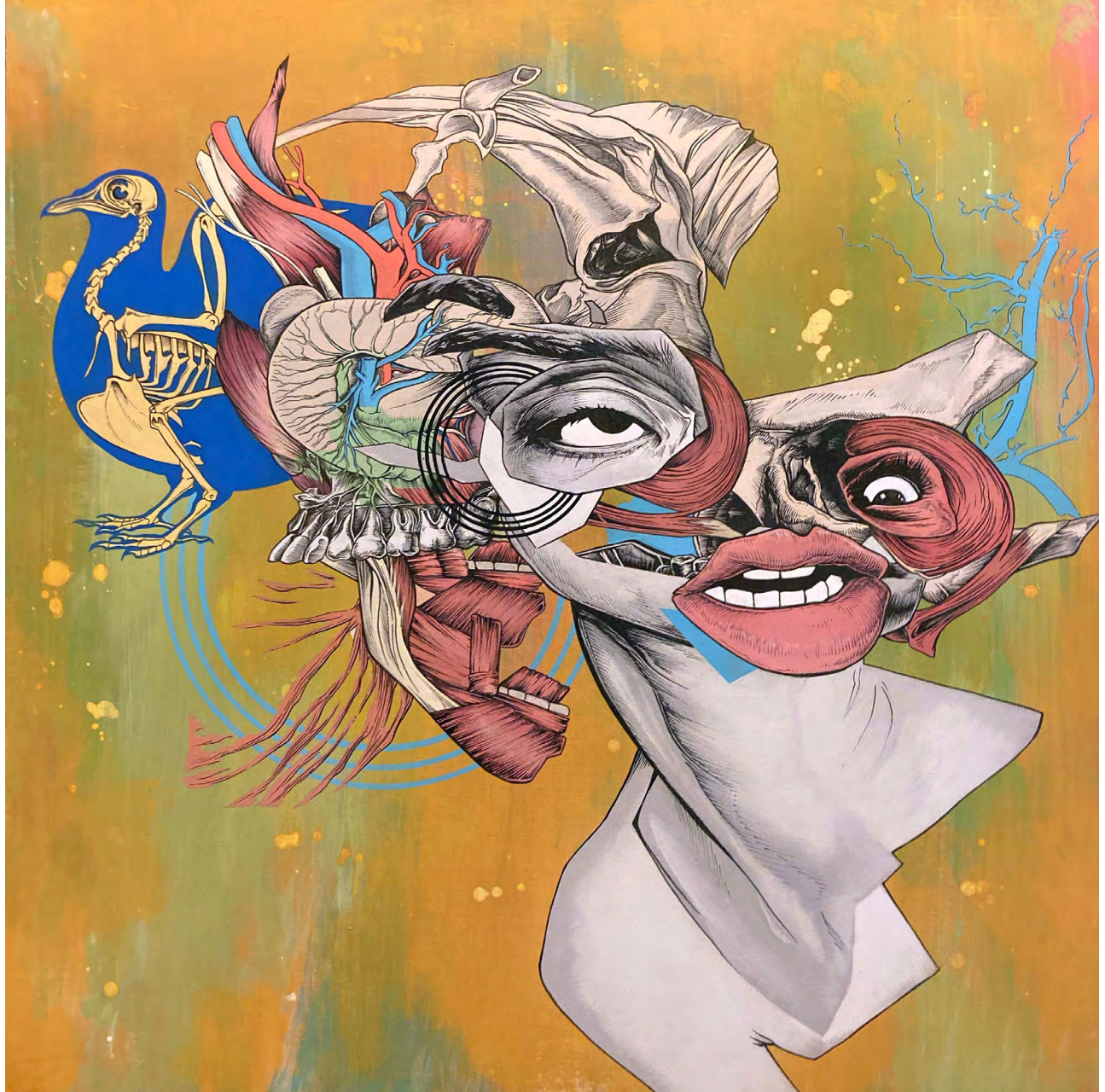
But it was such a lovely pumpkin By Brendan Rowe fineliner and psca on board 40x40cm, $450 SOLD