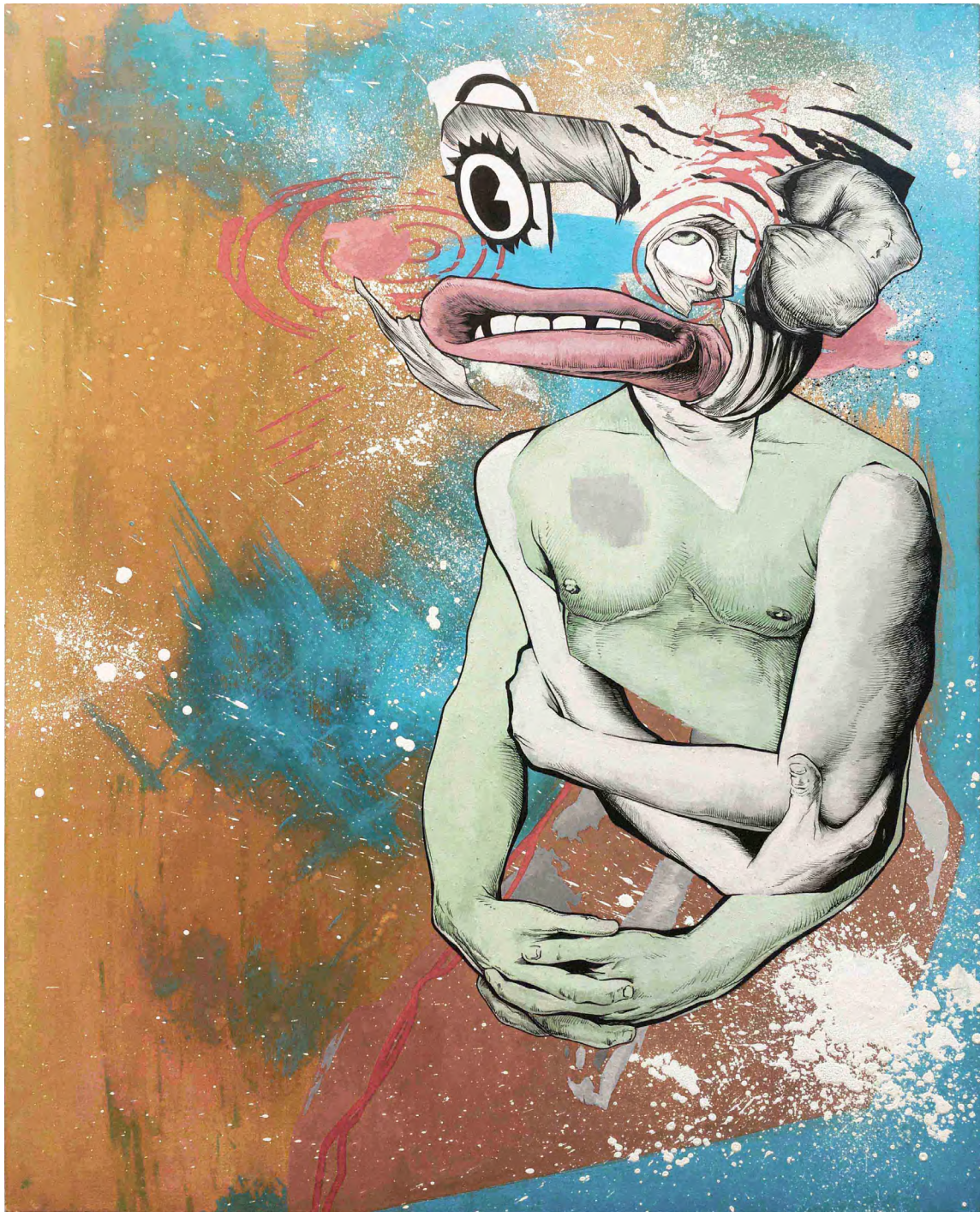
Sitting patiently waiting for a new hair style By Brendan Rowe Fineliner and posca on board 40x50cm $475 SOLD