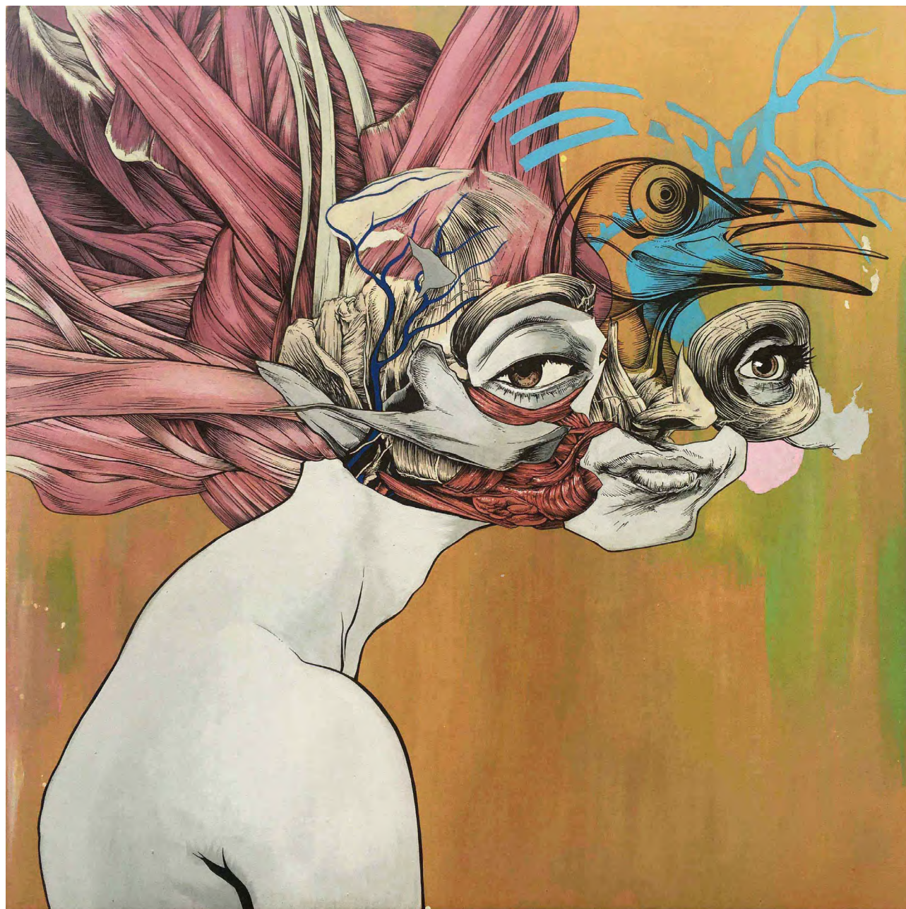
I specifically requested lickety sips mum By Brendan Rowe Fineliner and posca on board 40x40cm $450 SOLD