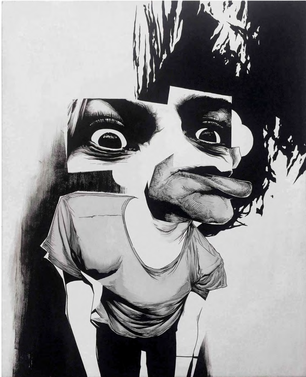
Pre-existing skateboard injury By Brendan Rowe Fineliner and posca on board 40x50cm $450