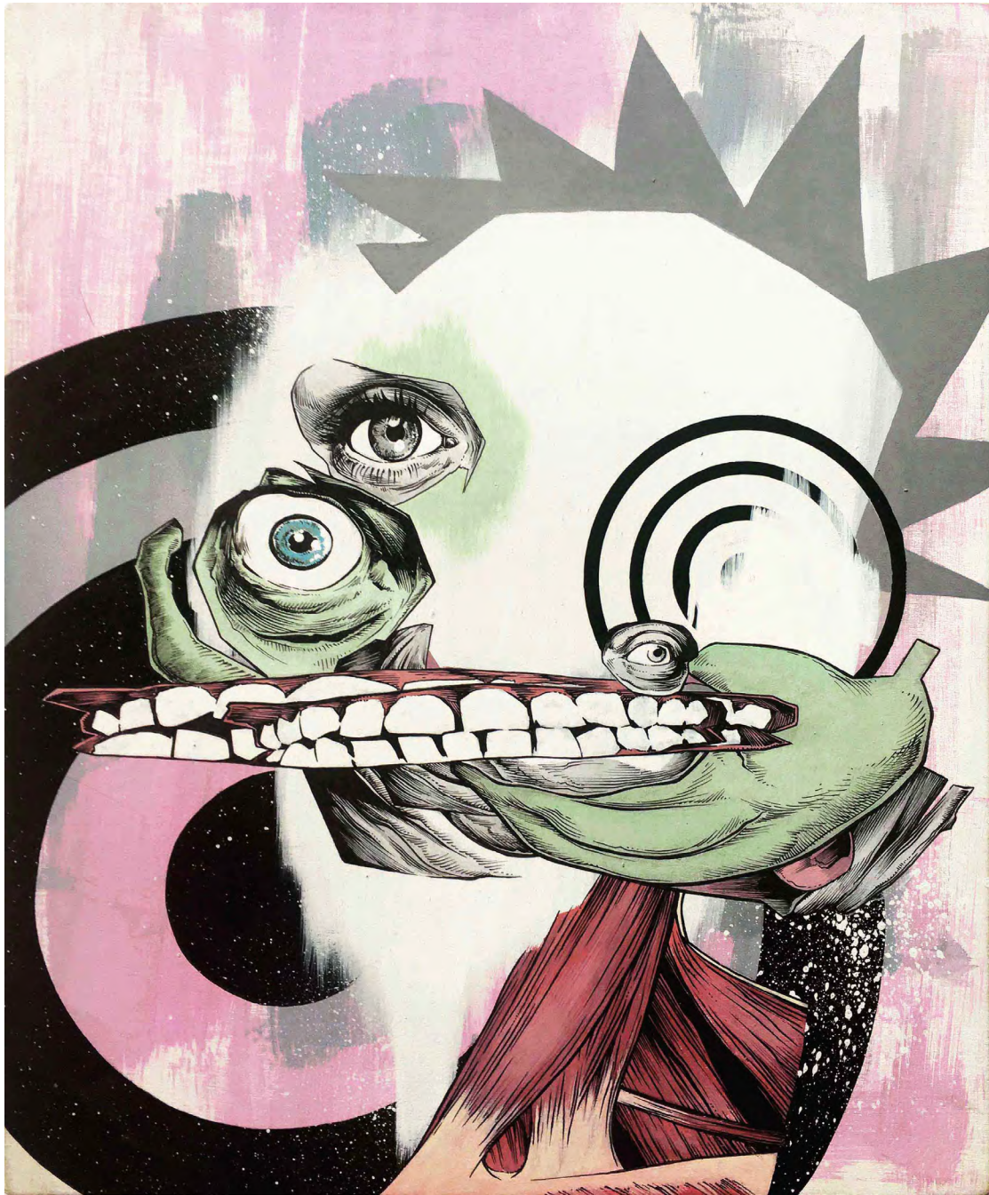
I dont know, that looks like too many teeth billy By Brendan Rowe Fineliner and posca on board 25x30cm $350 SOLD