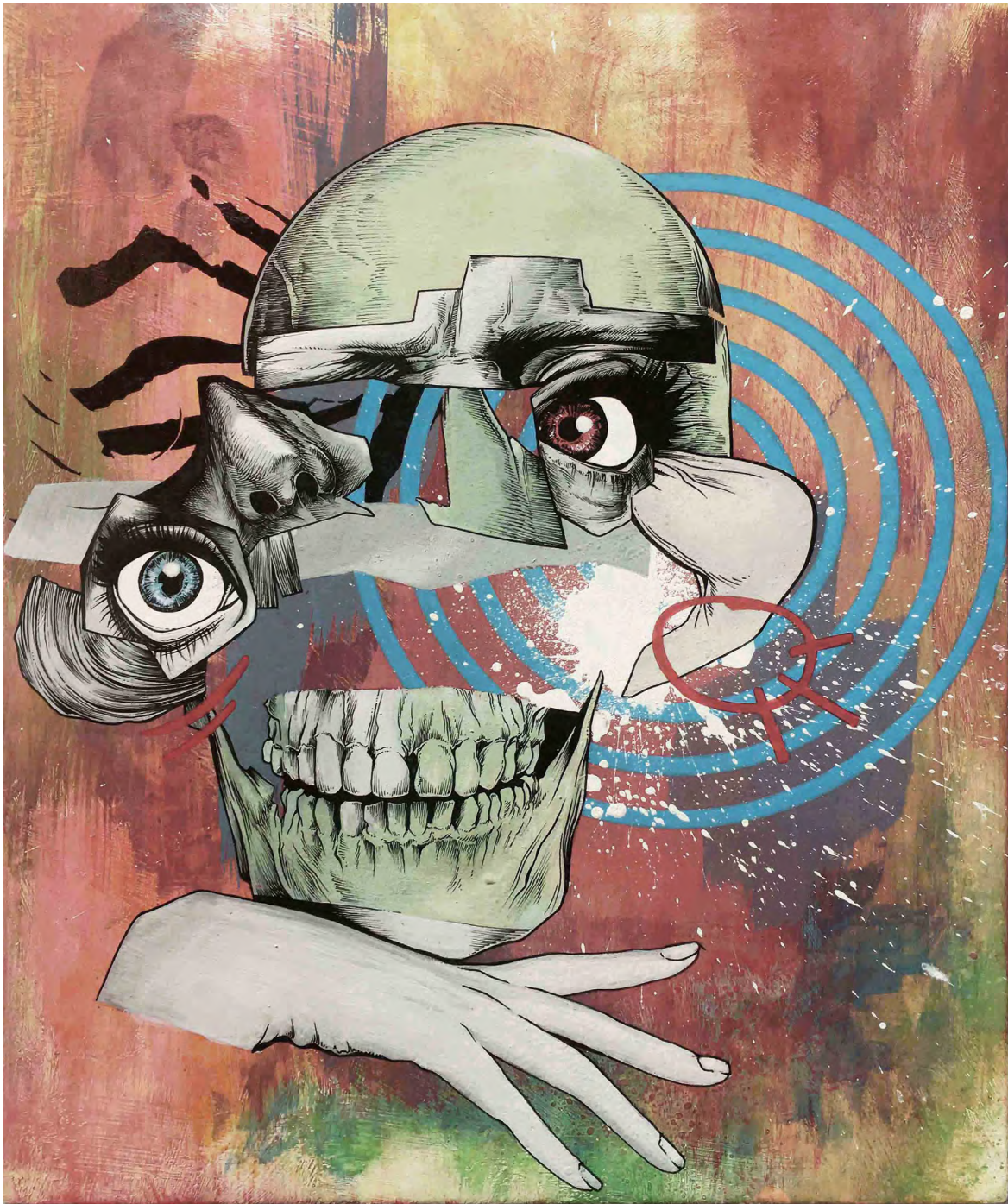
One moment morry By Brendan Rowe Fineliner and posca on board 25x30cm $350