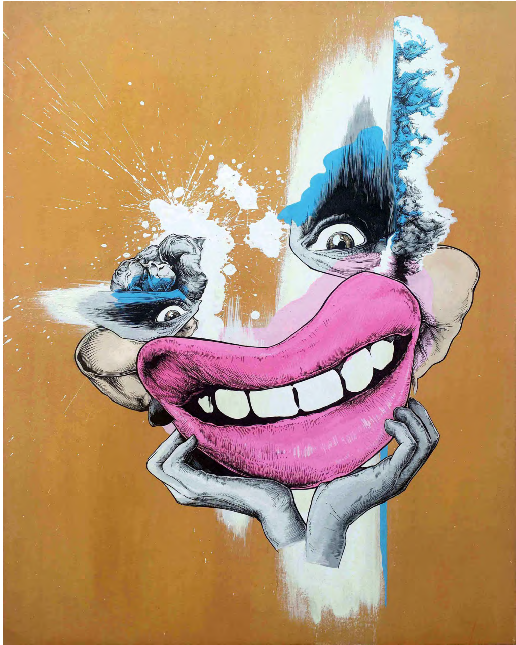
Bi-carb By Brendan Rowe Fineliner and posca on board 40x50cm $475