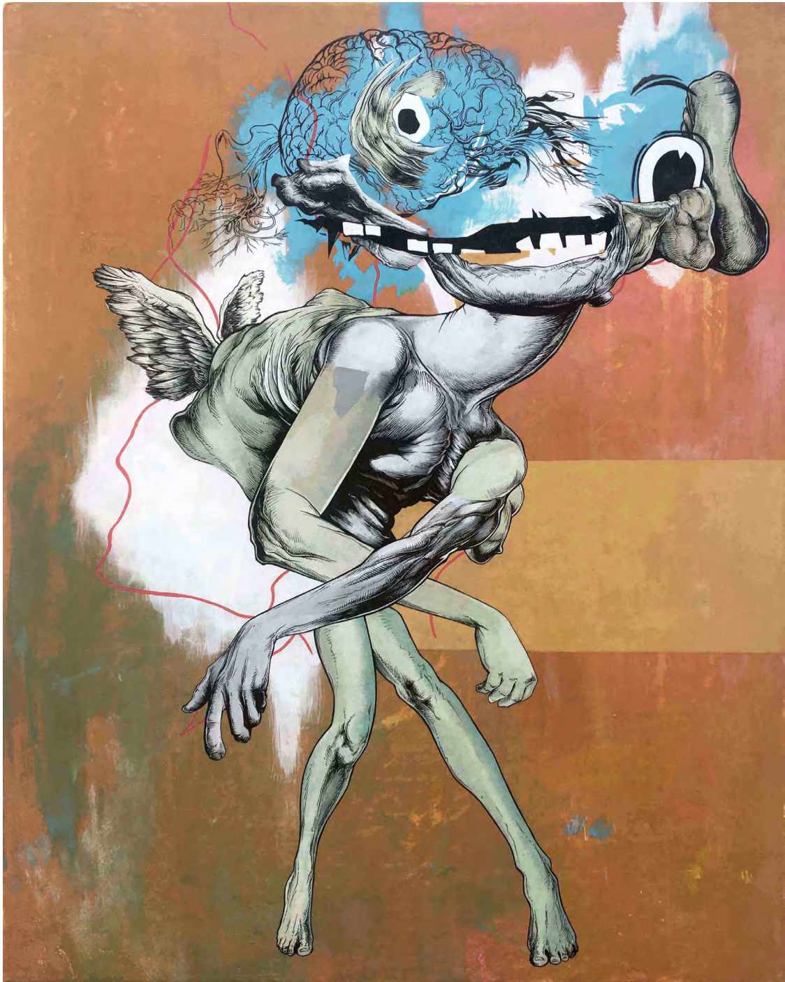
But we're not on fire are we By Brendan Rowe Fineliner and posca on board 40x50cm $475 SOLD