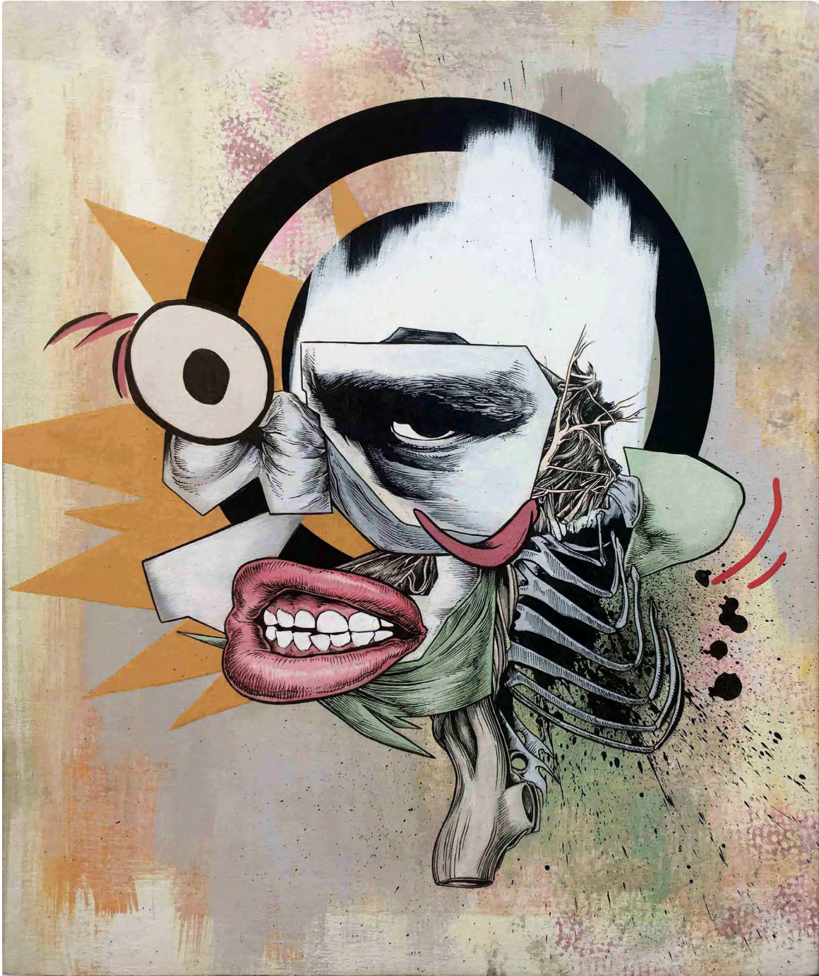
Test kitchen By Brendan Rowe Fineliner and posca on board 25x30cm $350